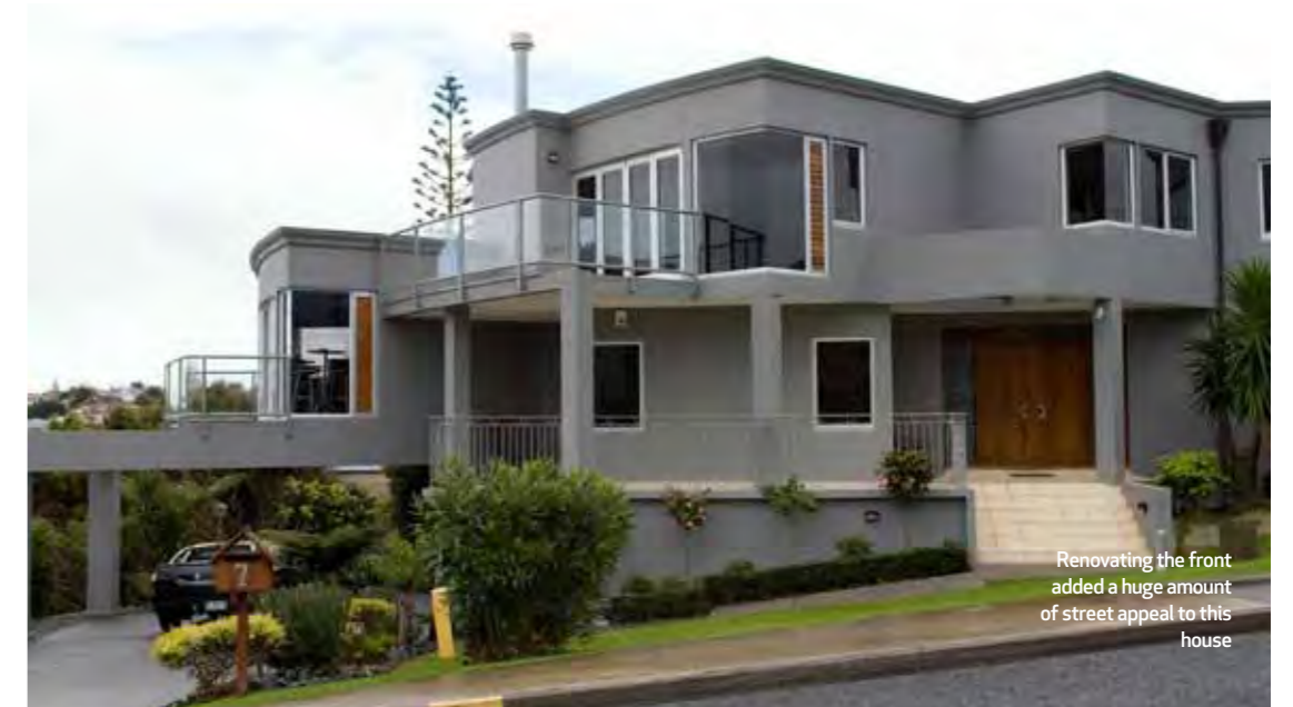
Renovating the front added a huge amount of street appeal to this house