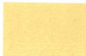
Egg White 10CW24