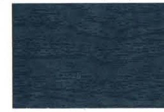
Deep Cove 10CW34