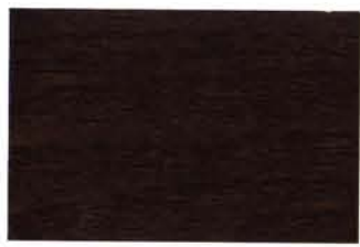
Deep Oak 10CW10

Colours will appear different on different timbers - always test your colour on an offcut before starting the main project.