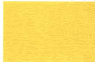
Creme De Banane 10CW23