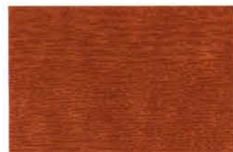
Red Beech 10CW20