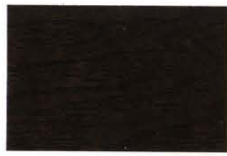
Dark Ebony 10CW14