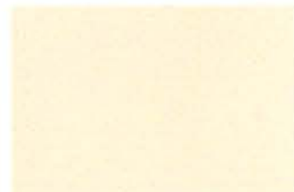
Rock Salt (blonding) 10CW25