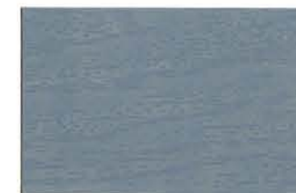
Pigeon Post 10CW36