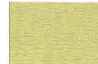
Pea Soup 10CW41