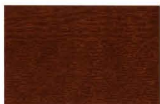
Dark Rimu 10CW16