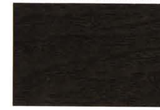
Black Pepper 10CW38