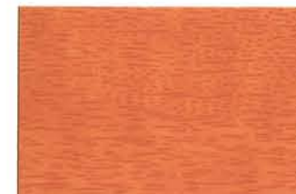
Peach Schnapps 10CW29