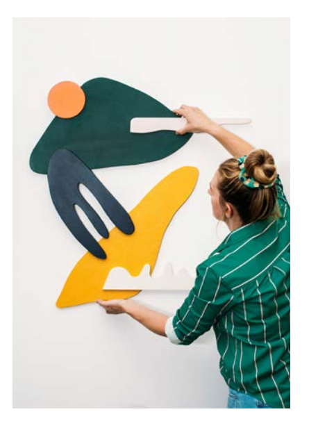
Tip I fitted my dowels in the back of one piece, then marked it with chalk and pressed it onto where I wanted it to sit. This gave me the exact position to drill the holes to slot them in.

Top tip If you're keen on a glossy contrast, overcoat selected shapes with Resene Concrete Clear gloss to make those colours and shapes pop.