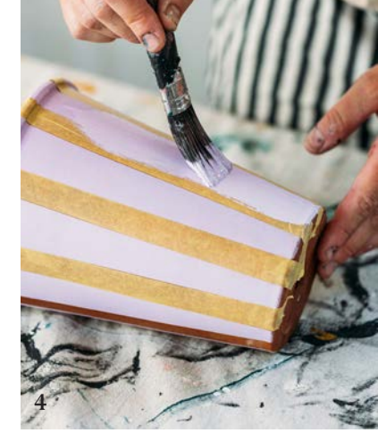
More Resene colours to try: