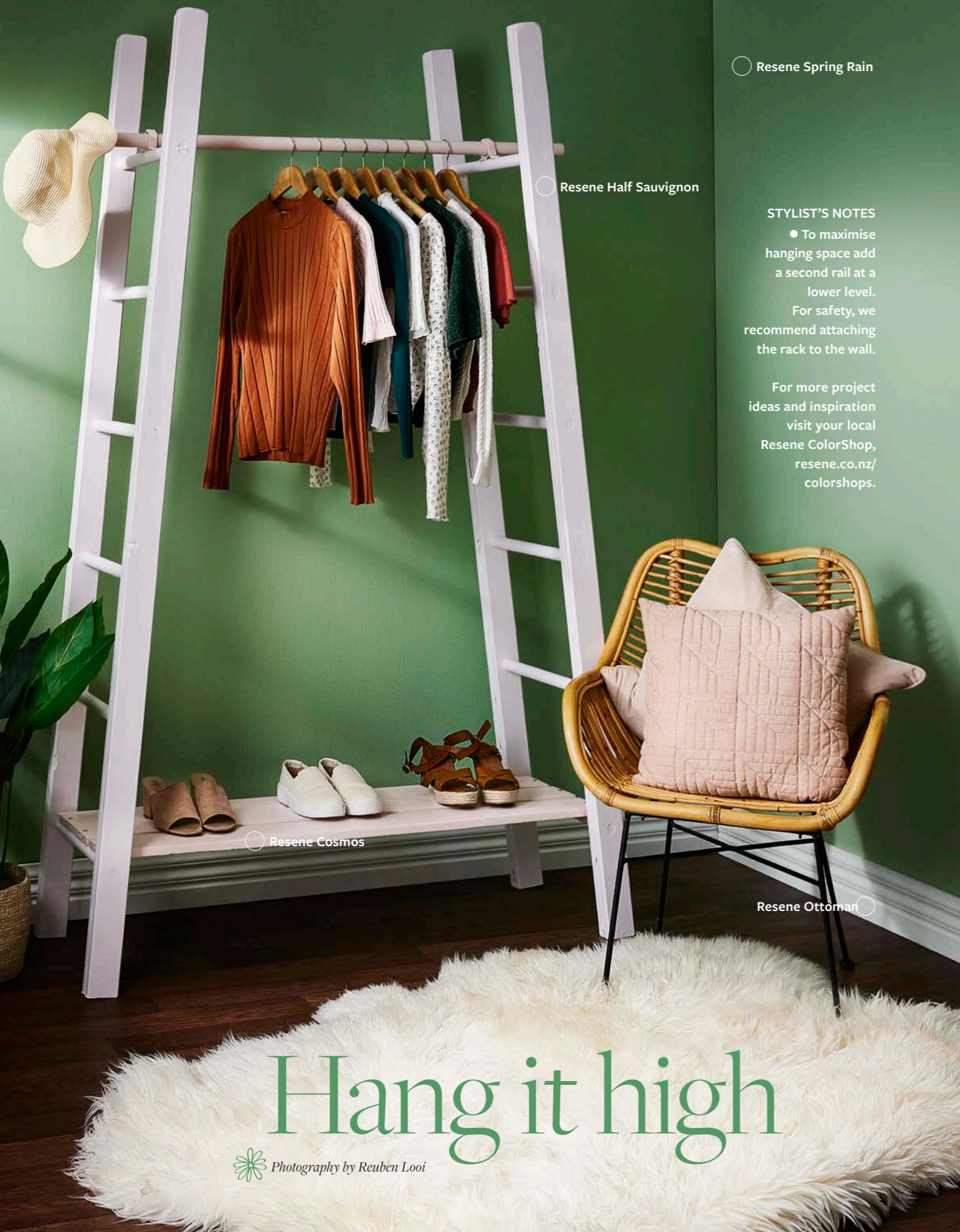
○ Resene Spring Rain