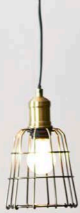
○ Resene Half Tea