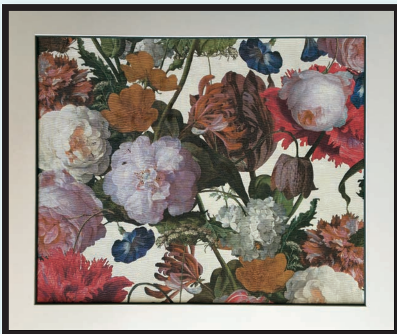
Resene Wallpaper 358005