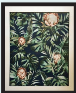
Resene Wallpaper 90222