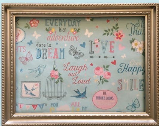
Resene Wallpaper 216714