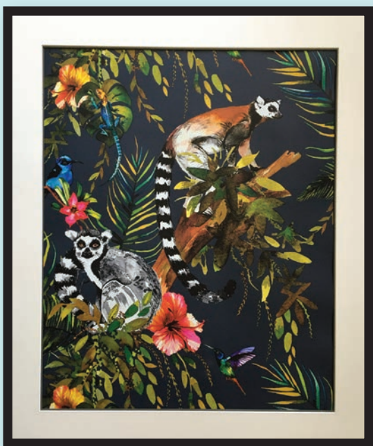
Resene Wallpaper 12403