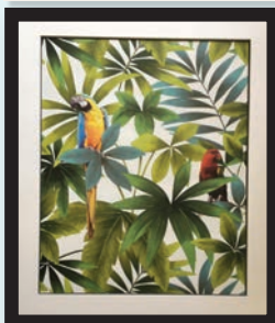
Resene Wallpaper J92914