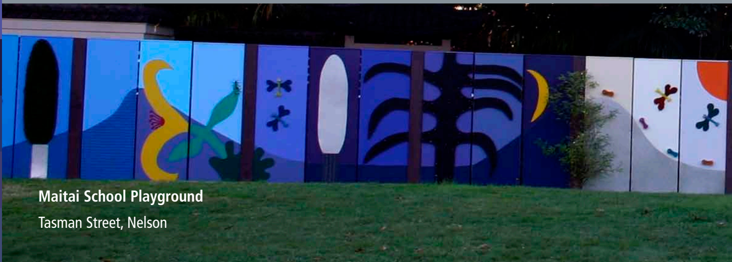
Maitai School Playground Tasman Street, Nelson