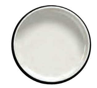
Resene Black White