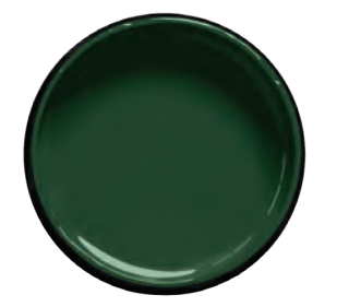
Resene Permanent Green

ON THE WALL Resene Permanent Green, (on the pegboard) Resene Black White, Resene Gum Leaf, Resene Flourish, Resene Kandinsky, resene.co.nz ALSO IN THE SCENE Ori Bunnies key ring , $25, mydeerfox.com. Rains long jacket in white, $180, fatherrabbit.com. Mirage Fedora by Lack Of Colour, $79, superette.co.nz. Le Femme petit handbag in salted creme, $375, georgiajay.com. Wall bracket painted in Resene Black White, $12, livingconcepts.co.nz. Living & Co fabric wall plug cable, $15, thewarehouse.co.nz. Dolly bulb, $12.50, flotsamandjetsam.co.nz. Planted Philodendron, $45, houseofbotanica.co.nz. Arnold Circus stool in chalk by Martino Gamper, $230, everyday-needs.com