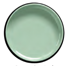
Resene Gum Leaf