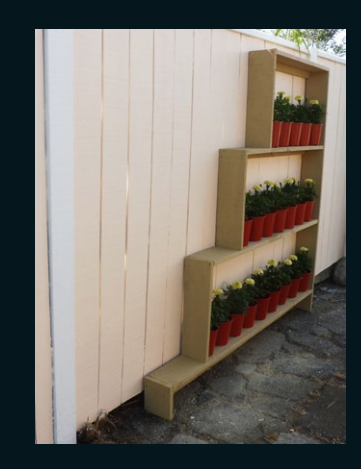
To get the look:

Mark stained the wooden garden shelves with Resene Waterborne Woodsman tinted to Resene Uluru.