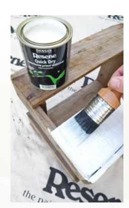
Step four Apply one coat of Resene Quick Dry to the crate and allow two hours to dry.