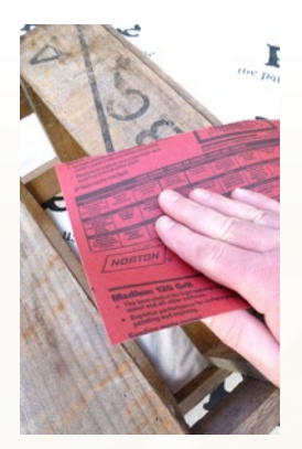
Step one Lightly sand the crate to remove any rough edges.