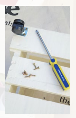
Step eight Fix the casters to the base of the crate with 16mm screws.

Turn an old wooden crate into a stylish storage box with a little bit of help from Resene.