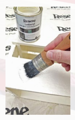
Step seven Apply a second coat of Resene Dutch White to the crate and allow two hours to dry.