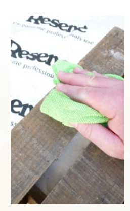
Step two Wipe off any sanding residue with a damp cloth. Allow wood to dry.