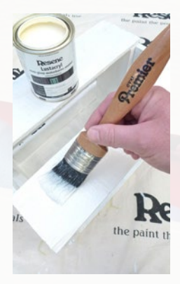
Step six Apply one coat of Resene Dutch White to the crate and allow two hours to dry.