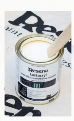
Step five Carefully stir the Resene Lustacryl.