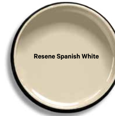
Resene Spanish White