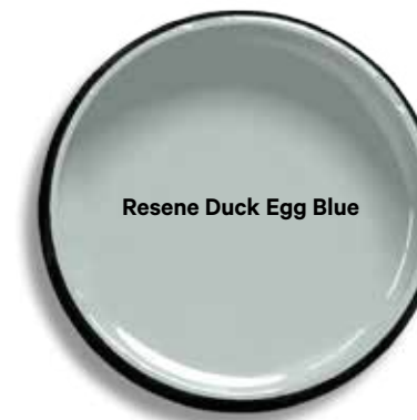
Resene Duck Egg Blue