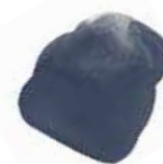
RESENE 'Wind Talker'

> Give your wood basket or box an update by painting it in a favourite colour, or try using Resene testpots to add a pattern or stripes for interest.