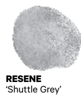
RESENE 'Shuttle Grey'