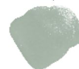
RESENE 'Good Life'