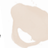
RESENE 'Double Merino'