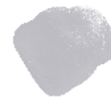
RESENE 'Santas Grey'