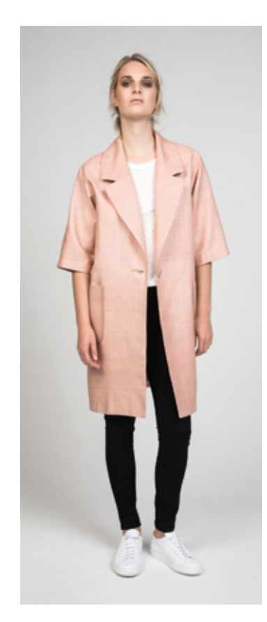
FASHION LOOK Duster coat in Blush, $799; Linen tank in White, $159; Ankle jean in Black Enzyme, $329, juliettehogan.com.