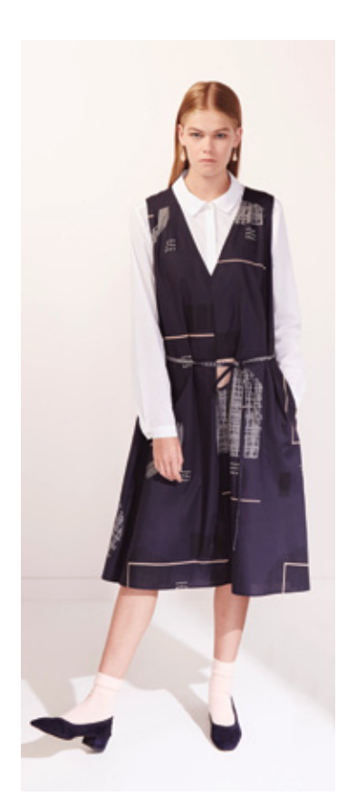
FASHION LOOK Cloudless shirt in White, $169; On the Horizon dress in Case Study print, $229, kowtowclothing.com.