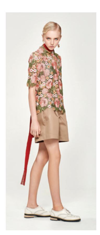
FASHION LOOK Eva top, $349; Amelia shorts, $299; Silk scarf, $149; Sylvester brogues, $379, katesylvester.com.