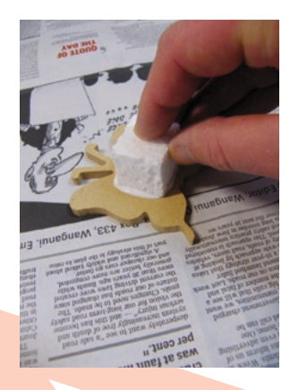
Step one Stick the piece of polystyrene onto the back of the MDF shape