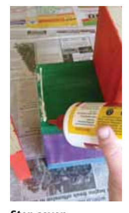
Step seven Continue to build the tower, gluing the Resene Greenstone square in place, followed by the two Resene Punch squares.