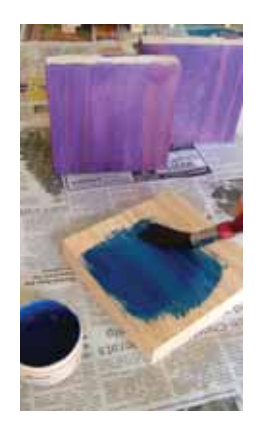
Step two Apply one coat of Resene Clairvoyant to two of the squares, and one coat of Resene Capri to one of the squares, following the direction of the grain. Allow