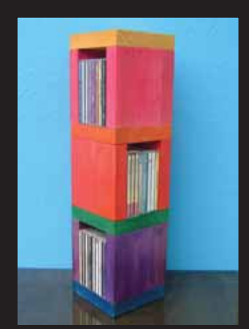
To get the look:

Mark painted the background wall with Resene SpaceCote Low Sheen tinted to Resene Havelock Blue.