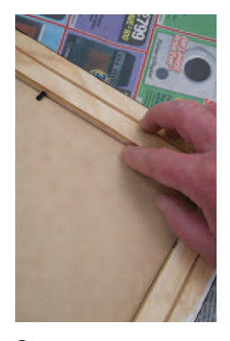
Step one Remove the backing board from the picture frame.