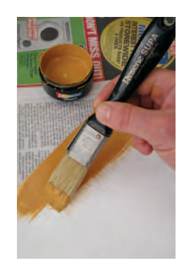
Step five Apply two coats of Resene Dark Buff to the backing board, allowing two hours for each coat to dry.