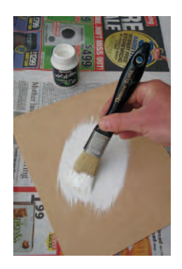
Step two Apply one coat of Resene Quick Dry to one side of the backing board and allow two hours to dry.