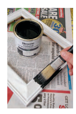
Step six Apply two coats of Resene Black to the picture frame, allowing two hours for each coat to dry.