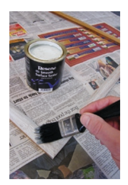
Step two Apply one coat of Resene Waterborne Smooth Surface Sealer to the picture frame and allow two hours to dry.