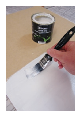
Step three Apply one coat of Resene Quick Dry to the piece of MDF and allow two hours to dry. Fix the piece of MDF into the picture frame with PVA glue and allow to dry.