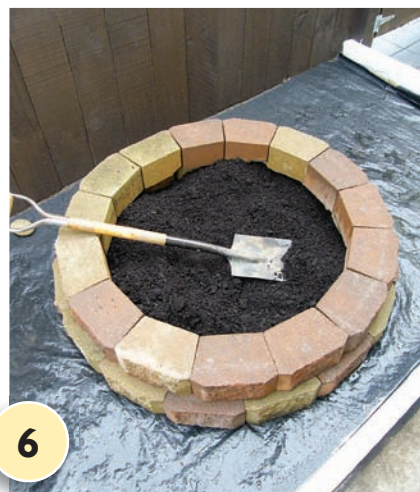
6 Fill the raised bed with some good quality potting mix.