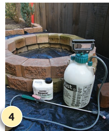
4 If necessary, spray the blocks generously with one part Resene Moss & Mould Killer mixed with five parts of clean water. After 48 hours, wash off with clean water.