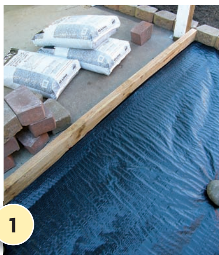
1 Prepare an area by removing weeds and levelling the ground. Then fix timber edging into position with garden pegs or by nailing the corners with 100mm nails.