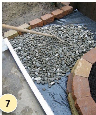
7 Spread some 40mm stones on the weedmat around the outside of the raised bed.