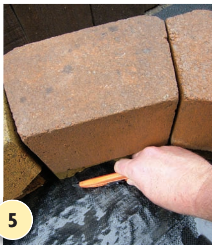
5 Use a craft knife to cut the weedmat around the inner base of the retaining blocks, as shown. Remove this circle of weedmat.