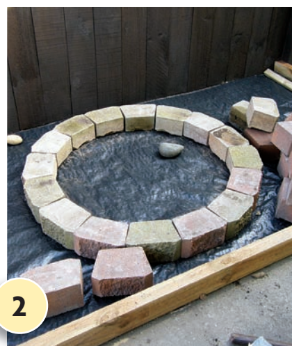
2 Lay weedmat and fix down with weedmat pins or pegs. Then arrange 16 of the retaining wall blocks to form a circle, as shown.