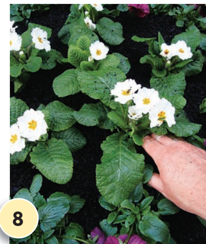
8 Plant up the bed with potted colour, as shown.