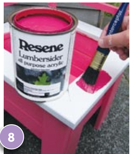
8 Apply two coats of Resene Geronimo to the planter's top rim, allowing two hours for each coat to dry. Fill with potting mix. Plant the ivy-leaved pelargonium against the support and the regal one in front.