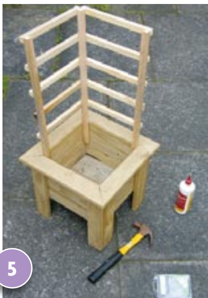
5 Nail and glue the support to the wooden planter, as shown.