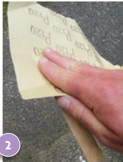
2 Smooth any rough edges with sandpaper.