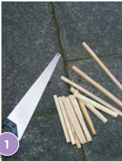
1 Measure and cut the garden stakes to the dimensions listed above.