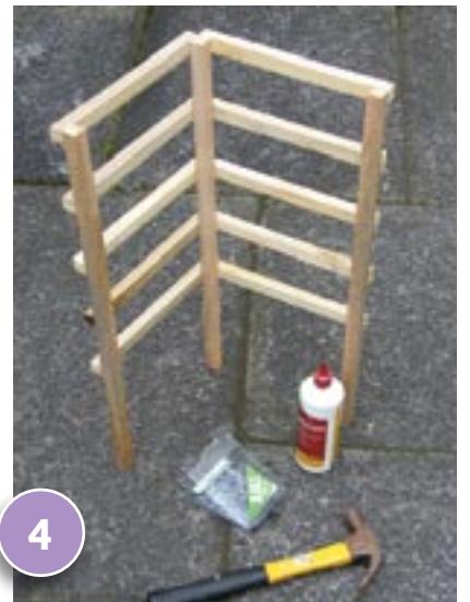
4 Attach the other lengths of wood in the same way to make a right-angled support, as shown.