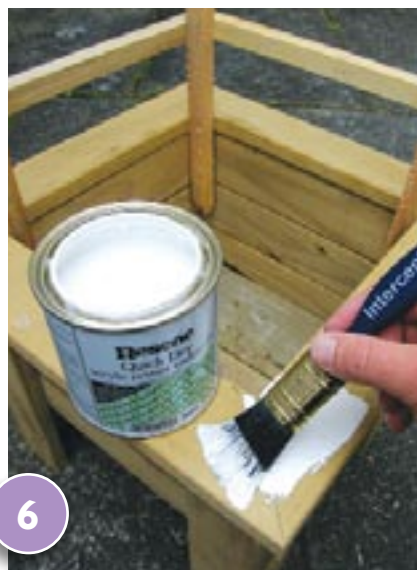
6 Apply one coat of Quick Dry primer to the planter and wooden support. Allow to dry for one hour.