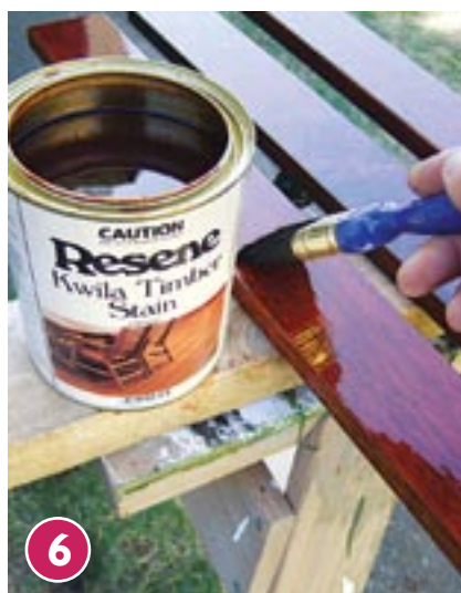
6 Apply one coat of Resene Kwila Timber Stain to the kwila slats.