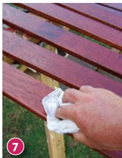
7 Wipe off any excess timber stain with a dry, lint-free cloth. Allow to dry thoroughly for 24 hours.