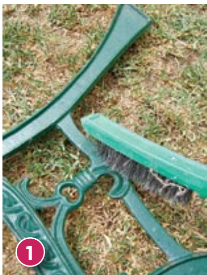
1 Dismantle the wooden bench. Use the wire brush to remove any areas of rust on the back panel and end legs, as shown.

Mark painted the background retaining wall with Resene Woodsman tinted to Resene Oiled Cedar.