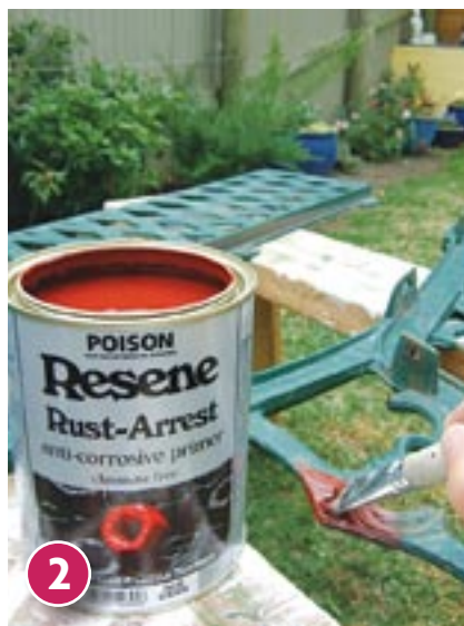
2 Spot prime the areas of bare iron with Resene Rust-Arrest. Allow to dry for 24 hours.