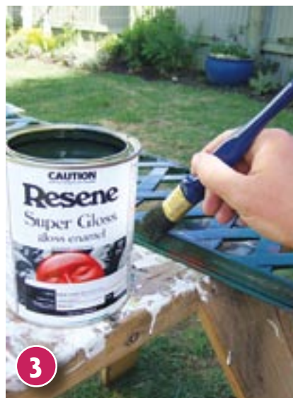
3 Paint the back panel and end legs with one coat of Resene Black Forest. Allow to dry for 16 hours before applying a second coat.