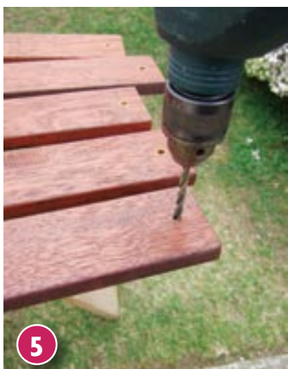
5 Measure and drill a 6mm hole at either end of the seating slats – again, use the original wooden slats as a guide.