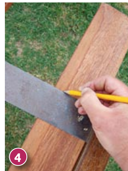
4 Using the original wooden slats as a guide, measure and cut the decking to size. Our slats were 75mmW x 1.2mL. Measure and cut the two smaller lengths for back panel.