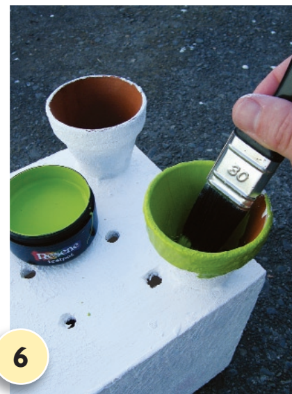
6 Paint the feet with two coats of Resene Limerick. As with other paint in this project, allow two hours for each coat to dry.