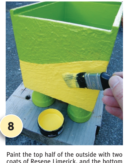
8 Paint the top half of the outside with two coats of Resene Limerick, and the bottom half with two coats of Resene Wild thing, making a curved upper line. When all paint is thoroughly dry, fill the box with bulb potting mix and plant your bulbs.