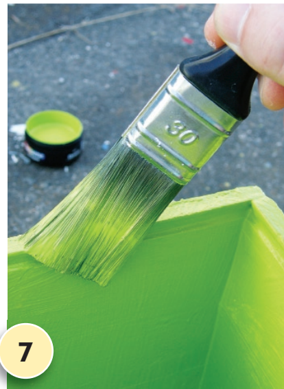
7 Paint the inside of the box with two coats of Resene Limerick, again allowing two hours for each coat to dry.