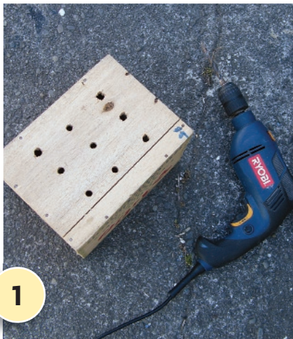
1 Drill drainage holes in the base of the wooden box, as shown.

For more on paints phone 0800 RESENE (0800 737 363) or visit www.resene.co.nz