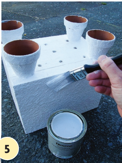
5 Apply one coat of Resene Sandtex to the outside of the feet and box, dabbing the paint on to create a textured surface. Allow to dry.