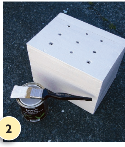
2 Apply one coat of Resene Quick Dry to the inside and outside of the entire box and allow two hours to dry.