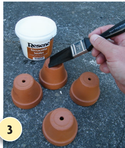
3 Apply one coat of Resene Terracotta Sealer to the pots and allow to dry