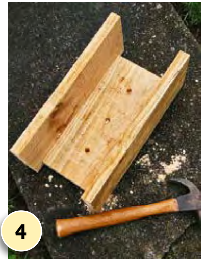
4 Attach two of the 400mm lengths of timber to the base piece, as shown, fixing with 50mm galvanised nails.