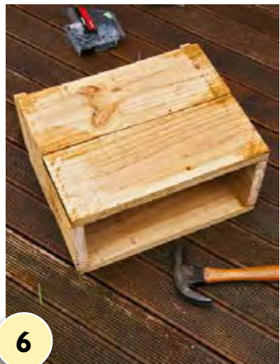
6 Attach the remaining 400mm lengths of timber into position to form the front and back of the planter. Fix with 50mm galvanised nails.