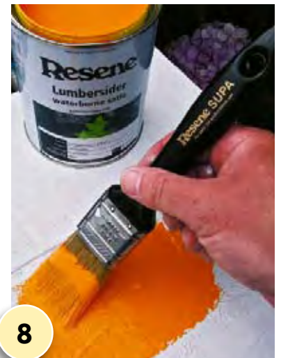
8 Apply two coats of Resene Outrageous to the entire planter, allowing two hours for each coat to dry.