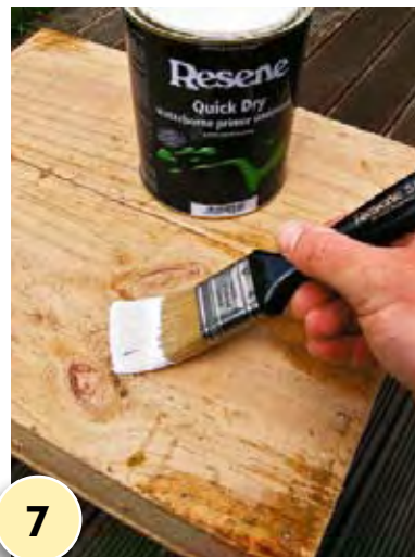
7 Apply one coat of Resene Quick Dry to the entire planter and allow two hours to dry.