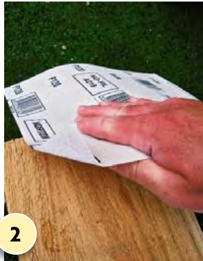
2 Smooth any rough edges with sandpaper.