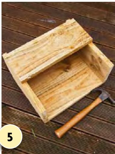
5 Attach the two remaining 350mm lengths of timber to the base and front of the planter, as shown, to form the sides of the planter. Fix with 50mm galvanised nails.