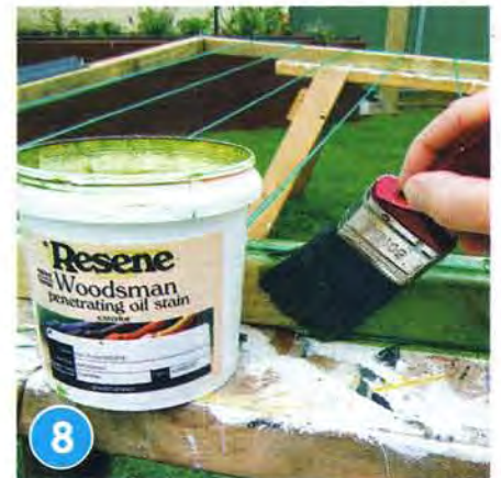
8 STAIN the outer frame with one coat of Resene Woodsman, and allow 24 hours to dry before applying a second coat.