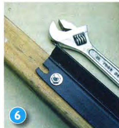
6 OVERLAP the two bottom corners in the same way and position the metal fence stakes along each side, aligning the lowermost hole (in the fence stake) with the corner of the frame. Drill through this hole and bolt through the corner joint as in step five. Drill through the uppermost hole and fix to the frame with a bolt, as shown.