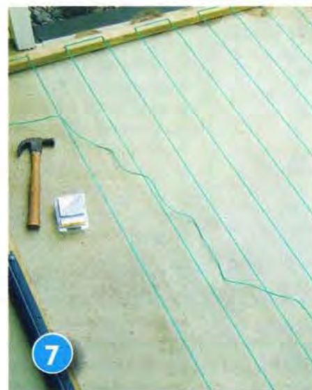
7 USING galvanised staples and a hammer, attach the washing line in an up-and-down, zigzag formation, about 155mm apart.