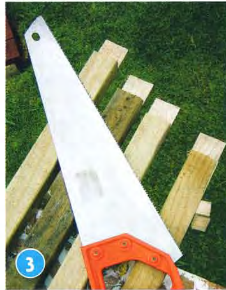
3 CAREFULLY saw halfway through each end of the timber using the first pencil line as a guide. Turn and saw back along the second pencil line, to remove a small rectangular piece of wood to form each corner joint.