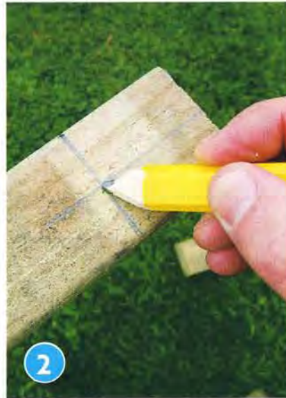
2 USE an offcut of the 50mm timber to mark a straight pencil line around each end of the four lengths of timber. Draw a second central line dissecting this at 90 degrees, as shown.