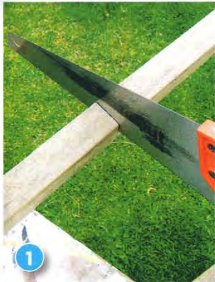
1 CUT the 50mm x 50mm timber into four 1.8m lengths.