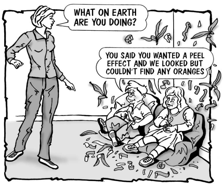
Painting with Eneser No. 60

In New Zealand PO Box 38-242, Wellington Mail Centre Call 0800 RESENE, visit www.resene.co.nz or email advice@resene.co.nz