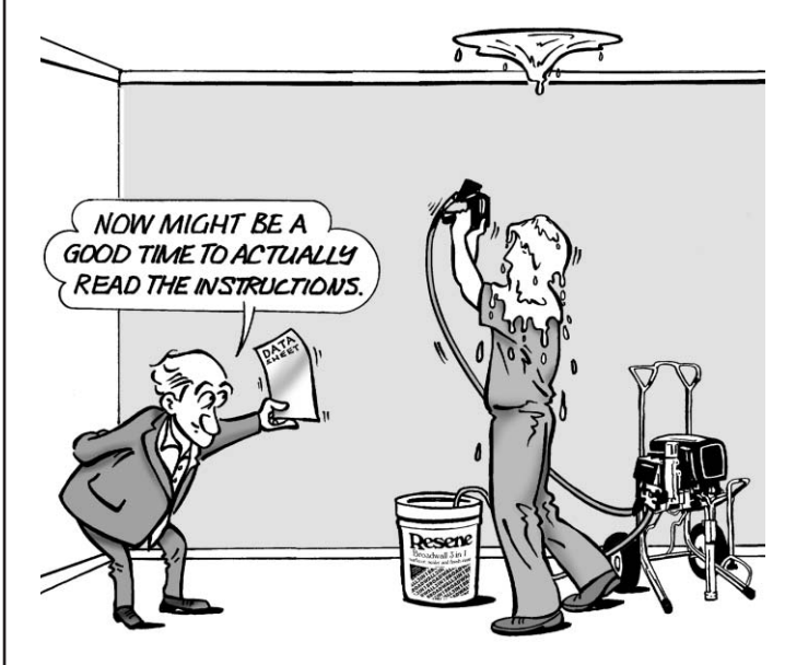
Painting with Eneser No. 67