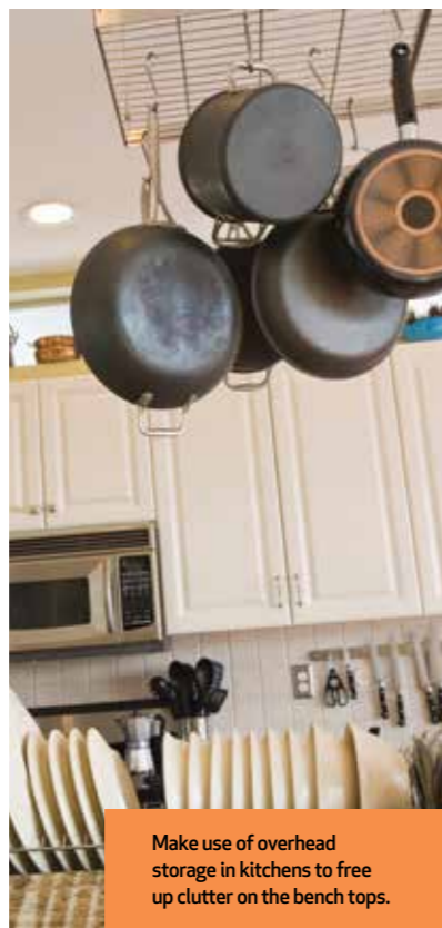
Make use of overhead storage in kitchens to free up clutter on the bench tops.