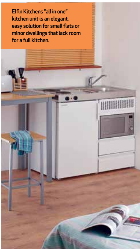
Elfin Kitchens "all in one" kitchen unit is an elegant, easy solution for small flats or minor dwellings that lack room for a full kitchen.

Small improvements garner larger gains. Added together, they'll make a big difference to your rental and could easily be the reason why your property is more ideal than another. ■