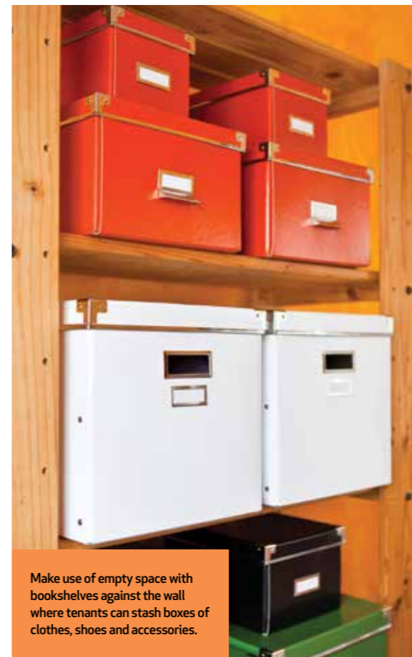
Make use of empty space with bookshelves against the wall where tenants can stash boxes of clothes, shoes and accessories.

Much can be achieved simply with paint. Most of us know the theory - whites and neutrals on walls and ceilings visually increase space. Within that, there's still a wonderful amount of choice. Check out