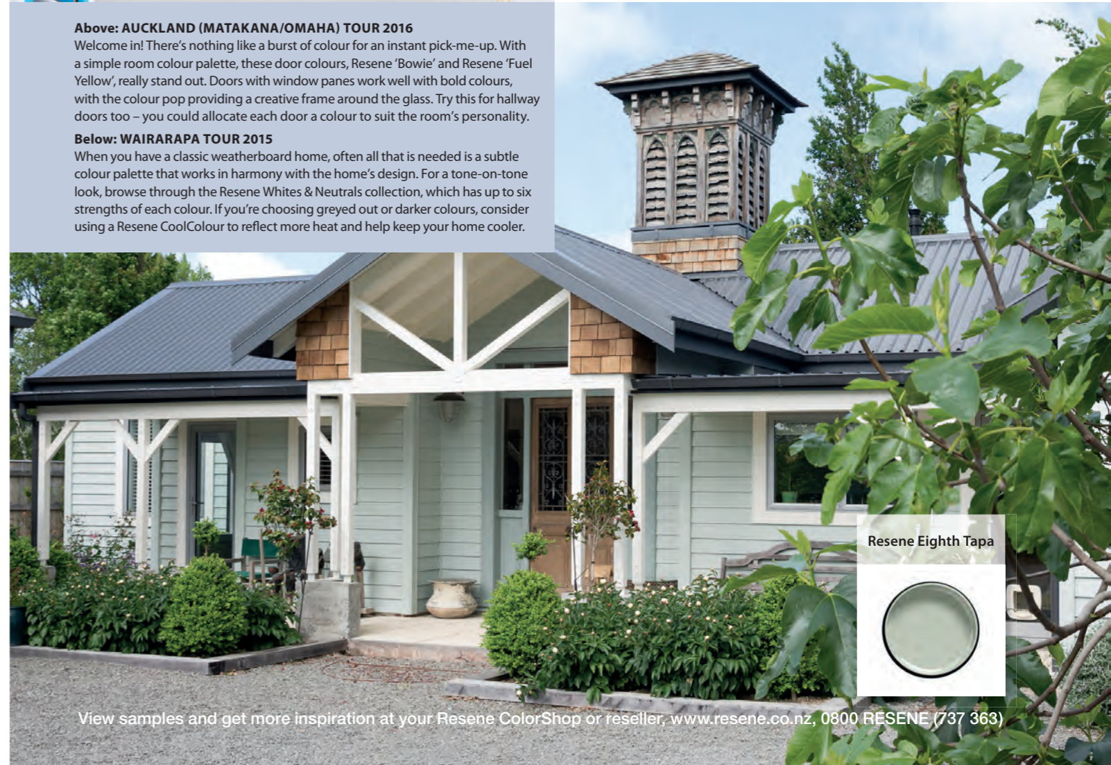
Resene Eighth Tapa

With many of us spending over 90 per cent of our time indoors, it's no wonder we want to bring nature inside. Recreate the view from your window and reinvent Mother Nature's colour combinations. Use moody neutral colours to upcycle furniture and accentuate your feature colour. Or use Resene Colorwood timber stain to enhance the beauty of natural wood grain.