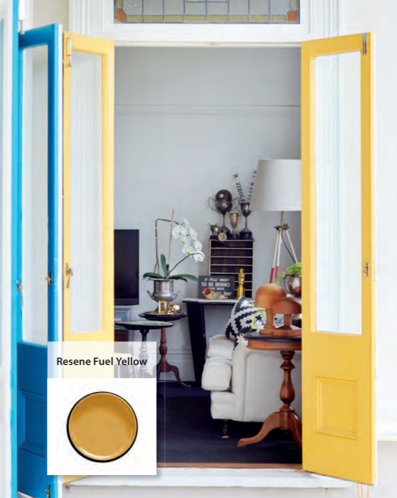
Resene Fuel Yellow