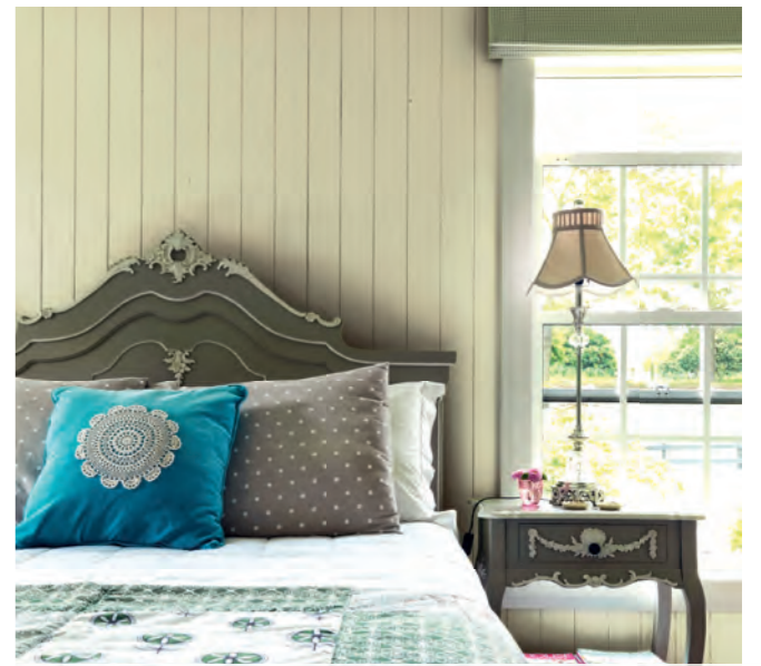
Resene Rice Paper

When you have a classic weatherboard home, often all that is needed is a subtle colour palette that works in harmony with the home's design. For a tone-on-tone look, browse through the Resene Whites & Neutrals collection, which has up to six strengths of each colour. If you're choosing greyed out or darker colours, consider using a Resene CoolColour to reflect more heat and help keep your home cooler.