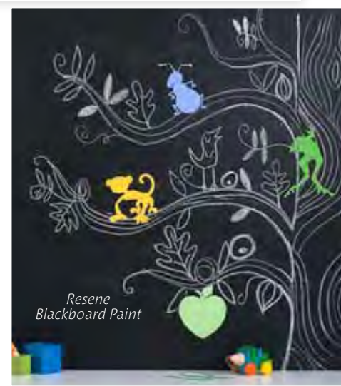
Resene Blackboard Paint