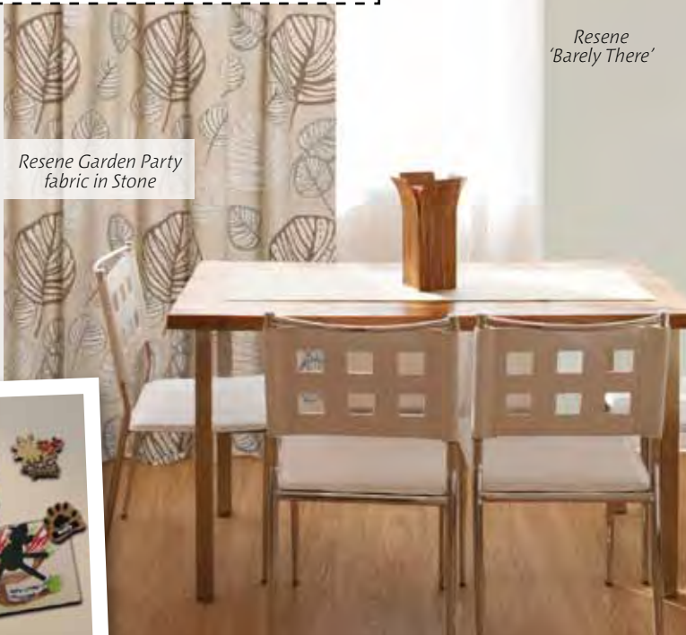
Resene 'Barely There'