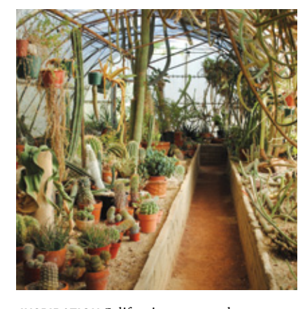
\textbf{INSPIRATION} \ California \ cactus \ garden.

STYLING Juliette Wanty