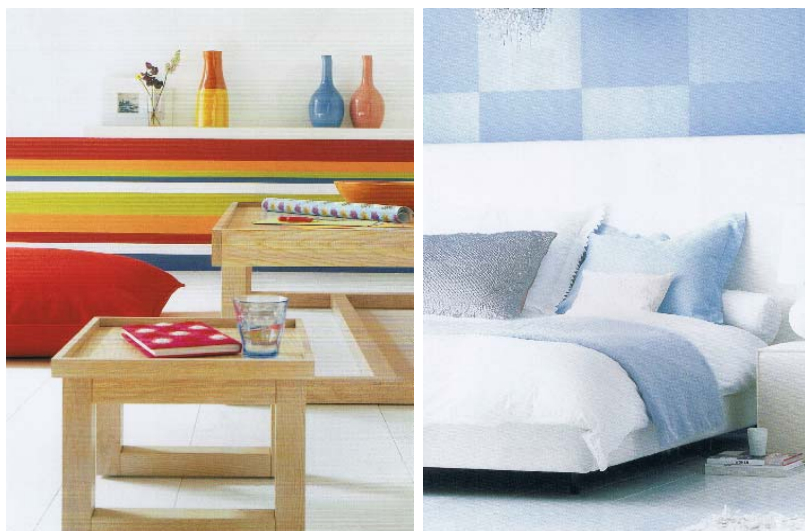
bright and energetic or soft and tranquil

Get the opinions from all people using the space before making final decisions - some may want a colourful and stimulating scheme while others may prefer something more restful, so you may need to strike a balance with colourful accents and accessories in a neutral coloured room scheme.