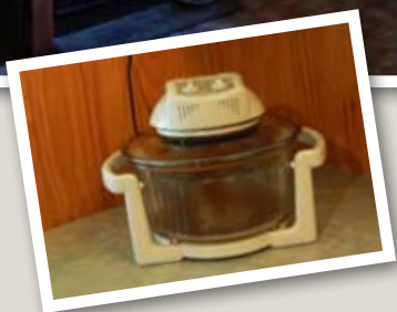
Above The winner's existing kitchen is a dark, outdated space with impractical cooking appliances.