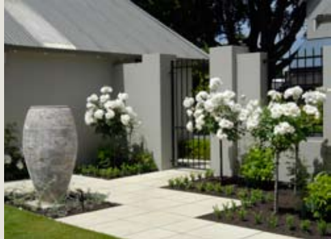
Left A path winds between a huge urn and standard iceberg roses.

Cathy, who now describes the garden as her 'baby', knew when she bought the property two-and-a-half years ago that renovation work would be extensive. But she's no stranger to hard work. She and Vance raised six children in another big old house – one possessing copious outdoor space, before their stint of apartment living near central city schools. For most of that time they escaped to a beautiful house and garden in Akaroa at weekends.