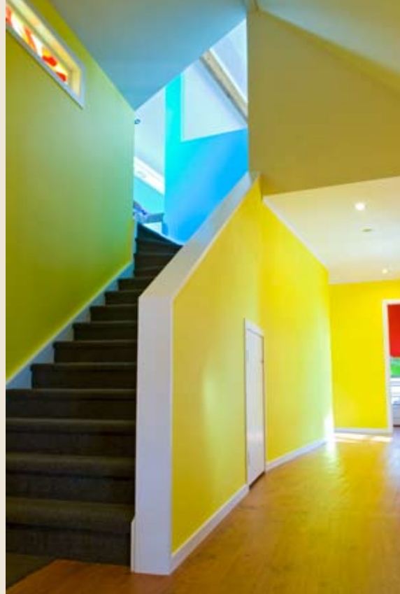
Left Comedian Ewen Gilmour and wife Cathy live at the beach full time.

Upstairs, the lofty bedroom is demure in Resene Spray. Angela suggested they paint some walls off-white (Resene Quarter Spanish White) to emphasise the appealing angles of the tall, pitched ceiling. The bedroom opens through bifolding windows above a window seat and extends to a balcony among the bows of a craggy old pohutukawa. It was this tree that first attracted Cathy to the property.