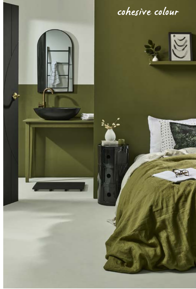
Above: Connect an ensuite to the main bedroom by balancing light and dark. The light and bright flooring in Resene Black White and Resene Eighth Black White used on the top half of the ensuite wall break up the Resene Waiouru used on the bedroom wall, shelf, vanity table and lower half of the ensuite wall. Door and wooden duckboard in Resene Nero, DIY artwork in Resene Nero and Resene Black White, bud vases in Resene Thorndon Cream and Resene Waiouru and ladder (reflected in mirror) in Resene Dusty Road. Sink, tapware, mirror and soap dispenser from Plumblaine, bedlinen from Kinship, cabinet from Bed Bath & Beyond, vase from Slow Store, towels from H&M Home.

projects Vanessa Nouwens, Melle van Sambeek words Tracey Strange images Bryce Carleton, Wendy Fenwick