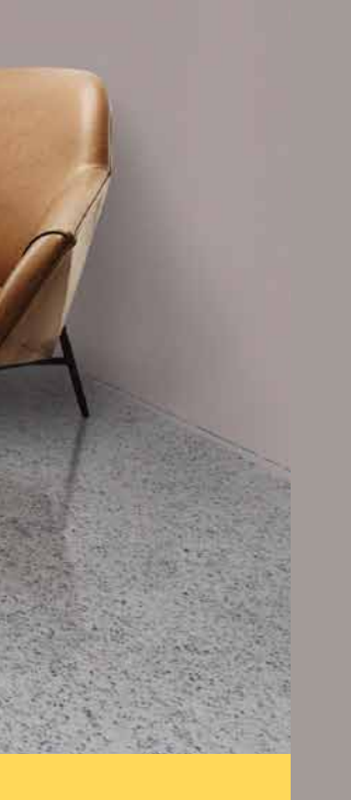
illustration Malcolm White

phone 09 525 3453 email ursula.vlasic@yellowfox.co.nz