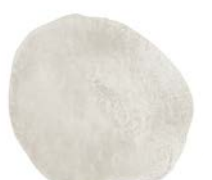
RESENE 'Quarter Lemongrass'