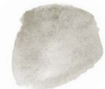
RESENE 'Quarter Evolution'