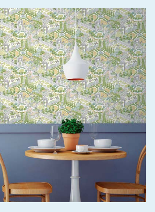
Wallpaper in a fun design suits a casual café table setting. This is design GP5935 from the Resene Wallpaper Collection. Team it with a deep blue such as Resene Astronaut.