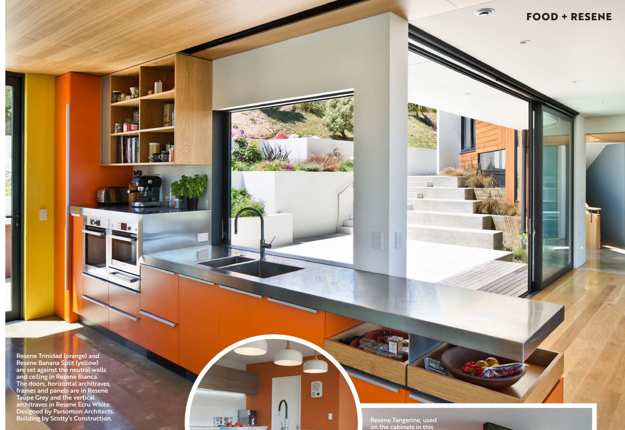
Resene Trinidad (orange) and Resene Banana Split (yellow) are set against the neutral walls and ceiling in Resene Bianca. The doors, horizontal architraves, frames and panels are in Resene Taupe Grey and the vertical architraves in Resene Ecu White. Designed by Parsonson Architects. Building by Scotty's Construction.

An all-yellow colour palette can be hard to trust in a kitchen, as the hue encourages our analytical instinct – the opposite of what you'd typically want in one of the most creative spaces in the home. However, small pops of