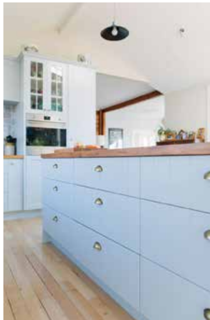
DESIGN BY ANNABEL BERRY & MEGHAN NOCKELS OF DESIGN FEDERATION

Trends come and go, but choosing what you really, truly love is what makes a house become a home.