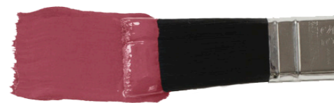
Resene Hippiie Pink

No longer strictly for Barbie, these shades of pink are sophisticated, cosy and modern. Delicious tones of sherbet and marshmallow never looked so good!