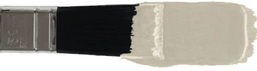
Resene Bison Hide