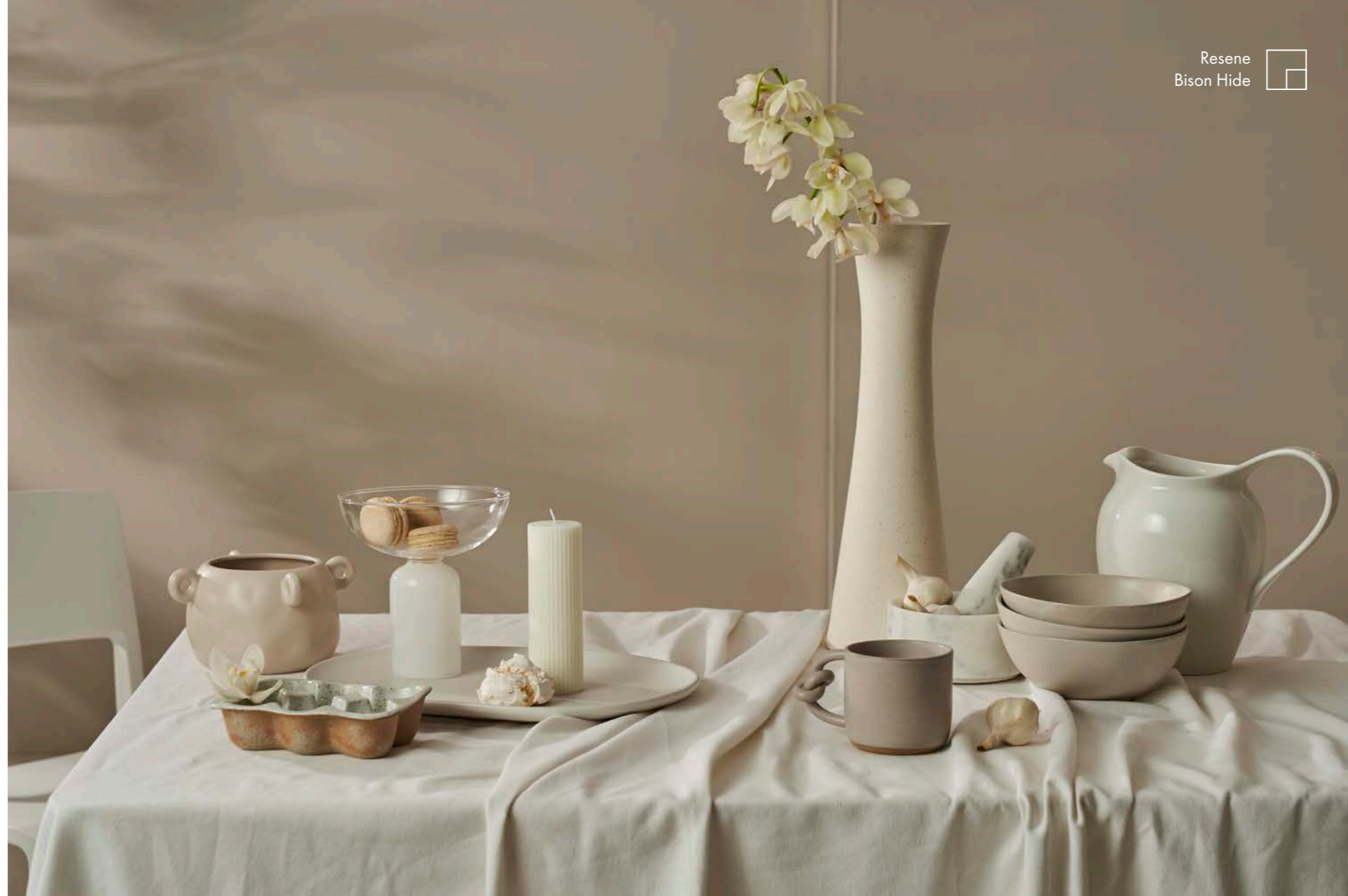
Resene Bison Hide

• When pairing white and cream tones, opt for warm whites rather than cool whites. Creams add a soft glow to a room when teamed with warm whites but can look murky against cool whites.