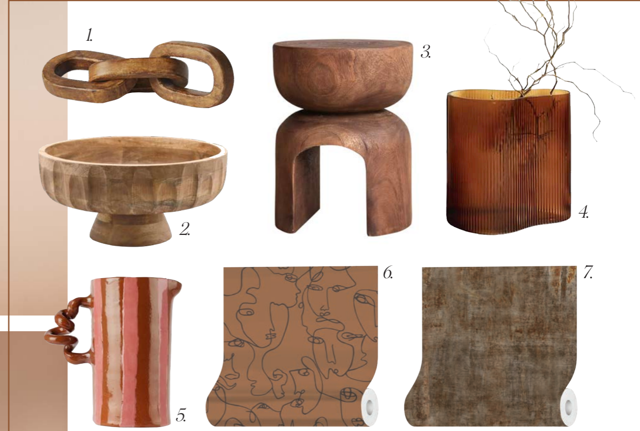
1. Early Settler Parvani Walnut wood chain, 2. Mooch Kenya Pedestal Bowl, 3. Kaya Studio Felix Stump, 4. Farmers Napa Glass Vase, 5. Harlie Brown Studio Stripe Delights Wiggle Jug, 6. Resene Wallpaper Collection 91271, 7. Resene Wallpaper Collection 429756