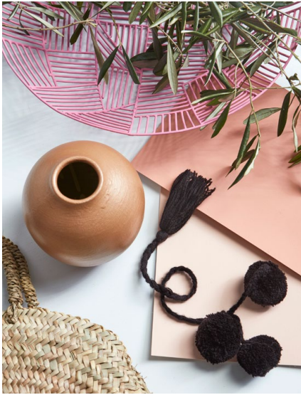
Above left: Background in Resene Poured Milk, mesh platter in Resene XOXO, vase in Resene Rose Gold metallic and A4 drawdown paint swatches in Resene Just Dance (darker) and Resene Sorbet.