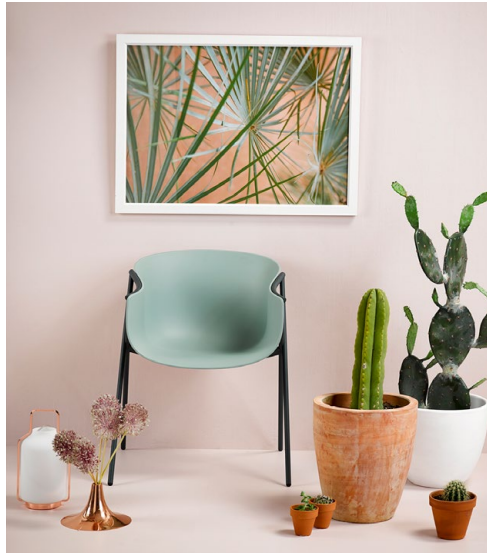
Above right: Walls and floor in Resene Blanched Pink.