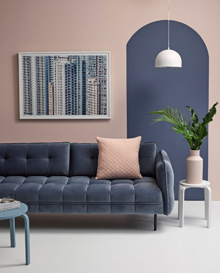
Above: Wall in Resene Soothe with Resene Avalanche arch detail, floor, small side table and pendant light in Resene Alabaster, coffee table in Resene Escapade, vase in Resene Soothe.

different shades. Peachy pinks are gentle, compassionate, composed, free-spirited, nurturing and youthful.