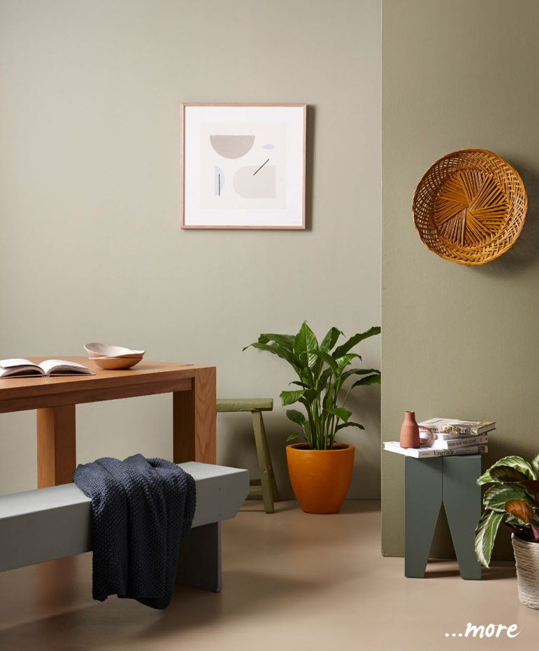
Above: Walls in Resene Bud (at back) and Resene Siam (side), floor in Resene Cargo, bench seat in Resene Innocence, peg stool in Resene Jurassic, stool at back in Resene Woodland, straw wall hanging in Resene Rusty Nail, plant pot in Resene Mai Tai and basket planter in Resene Double Lemon Grass.

In our second example, the colours are again tightly composed – this time in soft, muted greens. Burnt terracotta is a natural accent partner to greens, added here with painted pots and basketry. The space has a contemporary vibe, yet the colours and textures add just enough of an earthy edge to keep us grounded and reminded of nature.