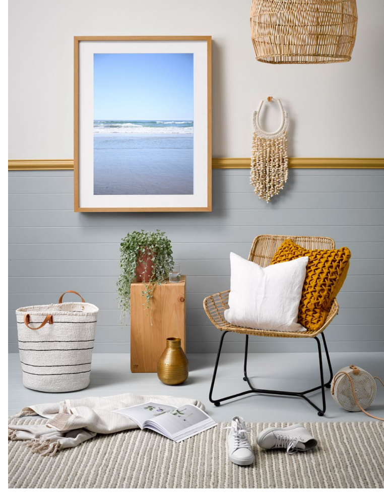
Above: Panelling and floor in Resene Half Dusted Blue, upper wall in Resene Quarter Albescent White and dado rail in Resene Papier Mache.