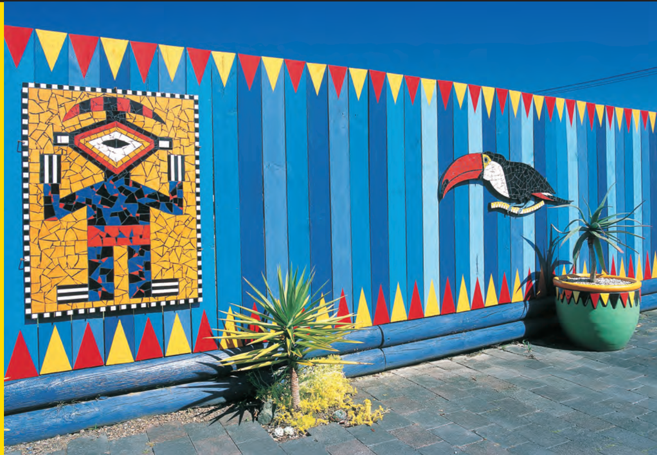
TEXT BY ROBYN WELSH.