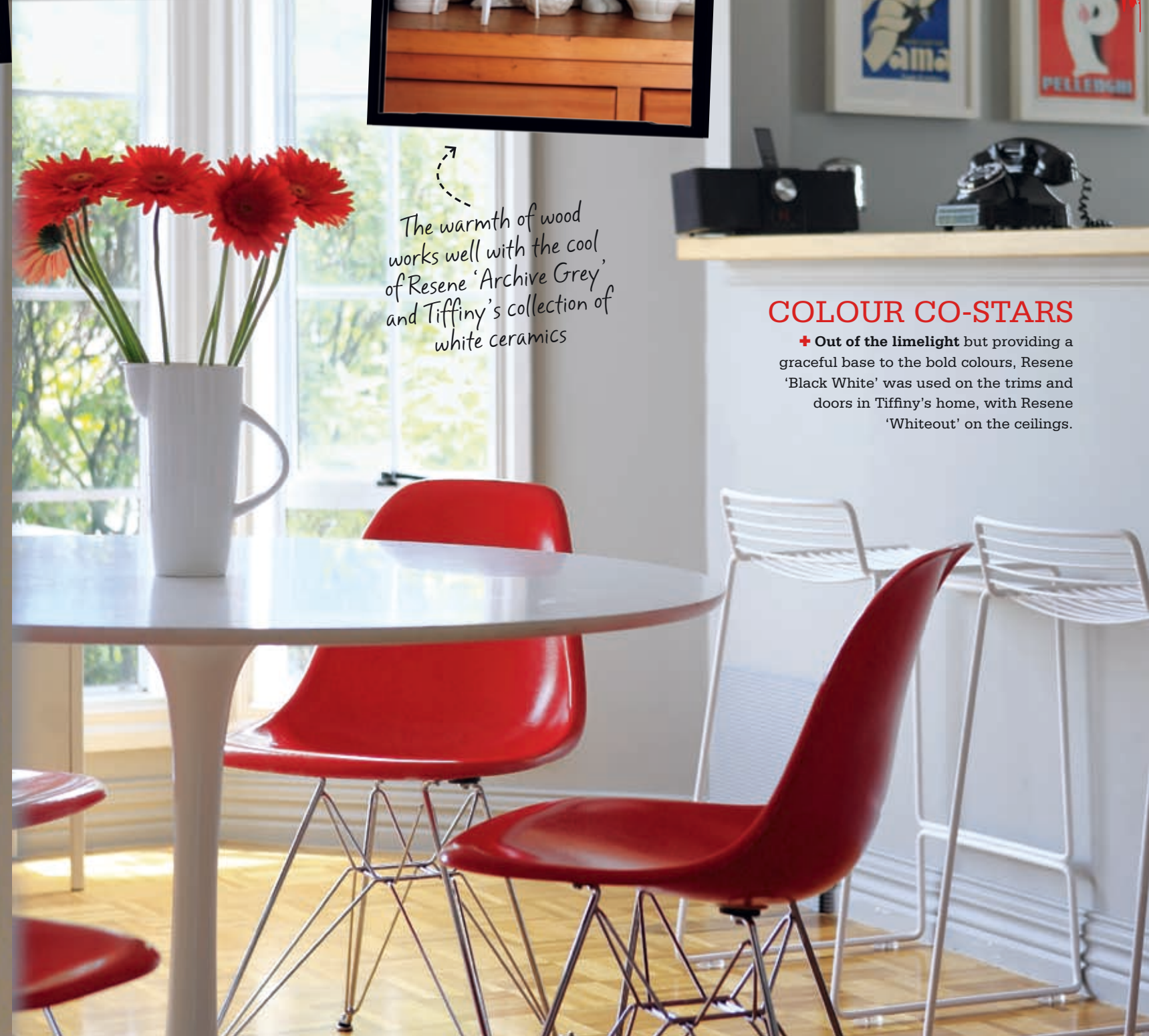
This photo Resene 'Archive Grey' on the walls and Resene 'Possessed' on the cupboards look great with Tiffany's red accessories. Inset shots Resene 'Sisal' in the lounge feels cool on hot days, yet warm and cosy in winter, she says.

Out of the limelight but providing a graceful base to the bold colours, Resene 'Black White' was used on the trims and doors in Tiffany's home, with Resene 'Whiteout' on the ceilings.