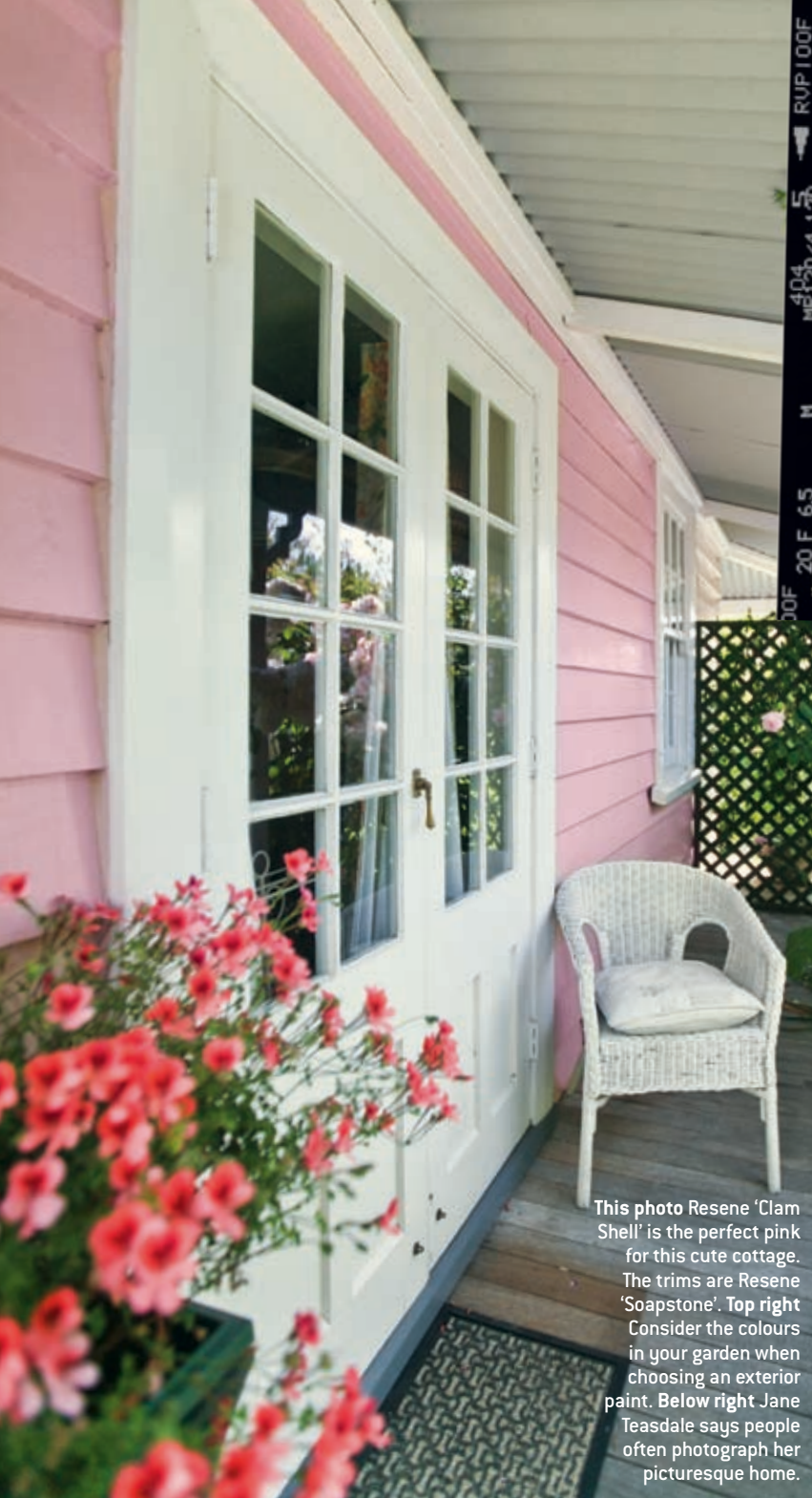
This photo Resene 'Clam Shell' is the perfect pink for this cute cottage. The trims are Resene 'Soapstone'. Top right Consider the colours in your garden when choosing an exterior paint. Below right Jane Teasdale says people often photograph her picturesque home.