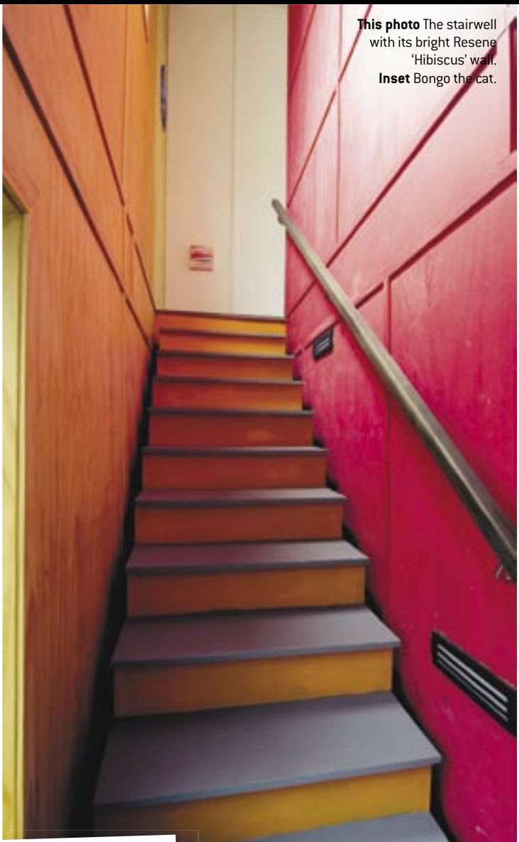
This photo The stairwell with its bright Resene 'Hibiscus' wall. Inset Bongo the cat.