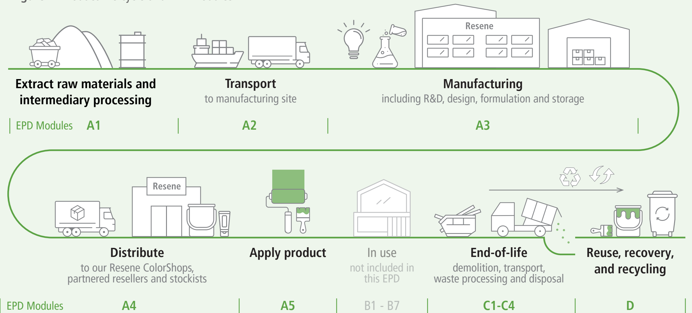
Figure 1. Product life cycle and EPD modules