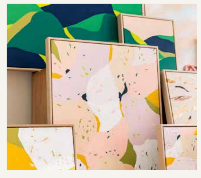
Are you a DIY perfectionist or do you leave it to the professionals? I definitely DIY but I am definitely not a DIY perfectionist!

One of my fave artworks I made with Resene paints is called Calm of the Sea/Laolao. I worked with Resene Blue Night, Resene Wax Flower, Resene Bismark and Resene Quarter Rice Cake for that piece. The artwork was bold and abstract and was featured on a magazine cover.